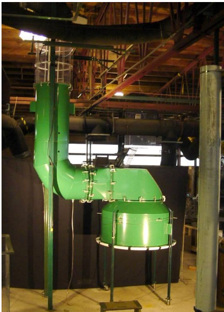
Figure 2 - Typical Single Absorber Wet Stack Flow Model

Physical flow models of wet duct and stack installations are normally built to a scale of between 1:12 and 1:16 and typically encompass the system from the outlet of the absorber mist eliminator to a point in the stack liner approximately 3 to 4 liner diameters above the roof of the breaching duct. Typical single and multiple absorber wet stack flow models are shown in Figures 2 and 3 respectively. To the extent possible, models are primarily fabricated from clear plexiglass to allow detailed visualization of the internal gas and liquid flows. To ensure that the liquid film motion in the primary collection zone of the lower liner are accurately simulated, care must be taken however to ensure that the surface of the material used in this area has wetting properties similar to that in the field.