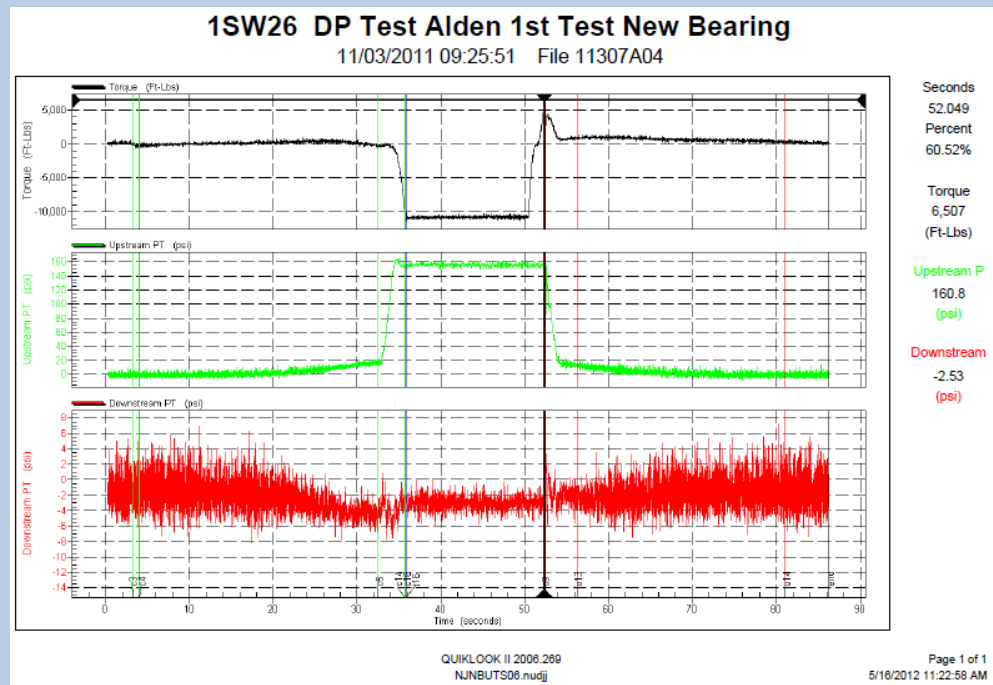
Figure 1: Traces of torque, upstream pressure and downstream pressure (a) before the installation of Bal-Seals and (b) after the installation of Bal-Seals.