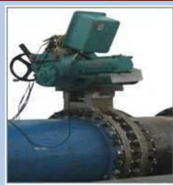
Salem's trident butterfly valve in the Alden test loop

DP testing provides a method to ensure the long-term capability of safety-related MOVs. Through the JOG PV Program, the US Nuclear Industry used DP testing to develop long-term periodic verification programs for most safety-related MOV designs and applications. A limited number of MOV designs/applications or new valve installations may be beyond the JOG PV guidance, however. For these MOVs, nuclear plants must develop their own periodic verification basis and validate a bounding bearing COF or valve factor. Although in-situ DP testing of these valves is the preferred approach, plant operations do not always allow for the required test conditions and/or the necessary testing time. In these cases, qualified testing laboratories can provide customized testing to be performed at any time including during a scheduled refueling outage.