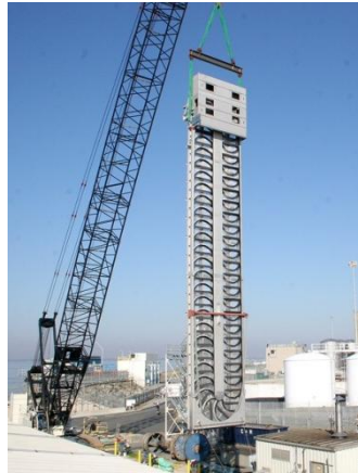
Figure 7 Passavant Geiger MultiDsic travelling water screen

Prior to implementing any sediment management strategies, Alden recommended that AES Gener conduct a detailed investigation to determine particle sizes for sediment accumulated in the intake bays, on the beach, and near the intake siphon bell mouths; the source of the suspended sediment; and the rate of sediment accumulation in the intake bays.