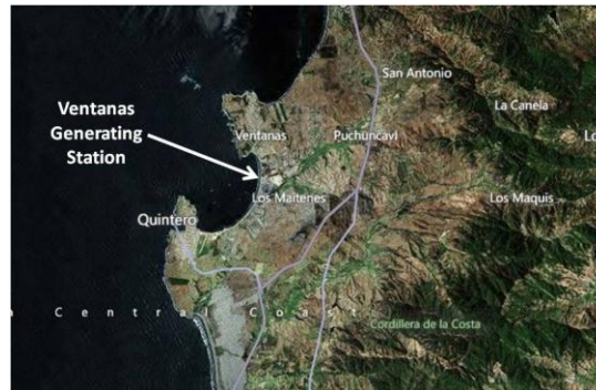
Figure 5 Location of the Ventanas Generating Station

Currents in the bay follow a clockwise circular pattern, entering the bay from the north and following the coastline to the south before turning north at the southeastern end. The water is discharged through separate discharge pipes back into the bay.