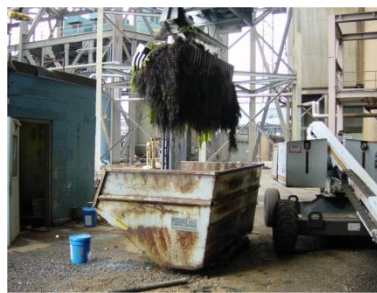
Figure 6 Algae removed from the trash rack at Ventanas

At times, the accumulation of algae on the screens is so great that the differential pressure created a large gap between the screen mesh frame and the guide seal plates through which debris passed. In addition to the algal clogging, a site inspection revealed sediment deposition in the intake siphon pipes and intake structures; therefore, an evaluation was also done to alleviate this problem.