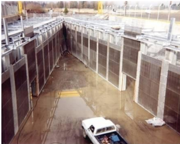
Figure 4 Angled screen diversion system