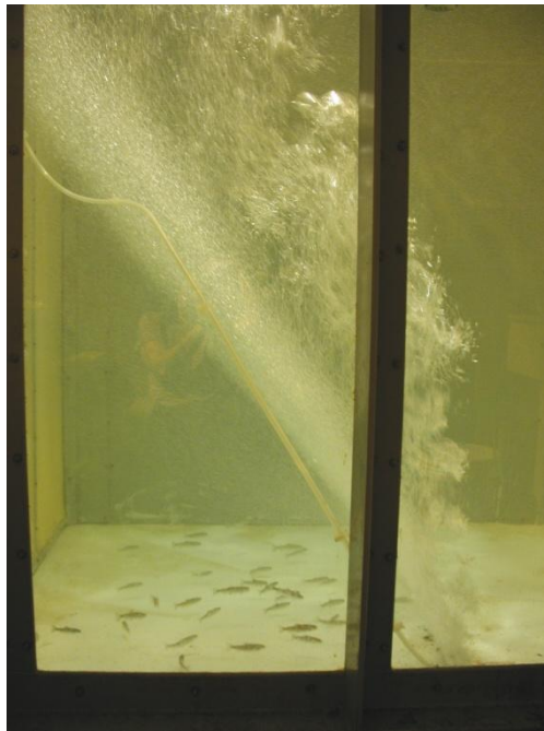
Figure 1 Laboratory evaluation of an air bubble curtain used as a behavioural technology for preventing entrainment of fish