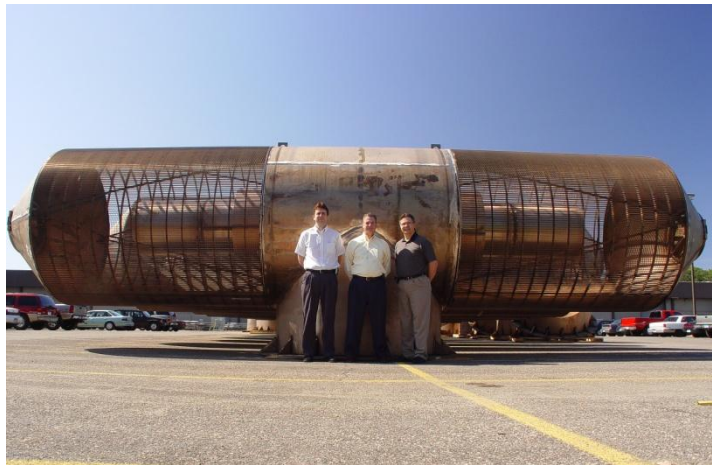
Figure 2 Cylindrical wedgewire screen used as an exclusion technology